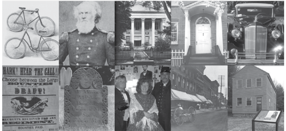
THE MIDDLESEX COUNTY HISTORICAL SOCIETY